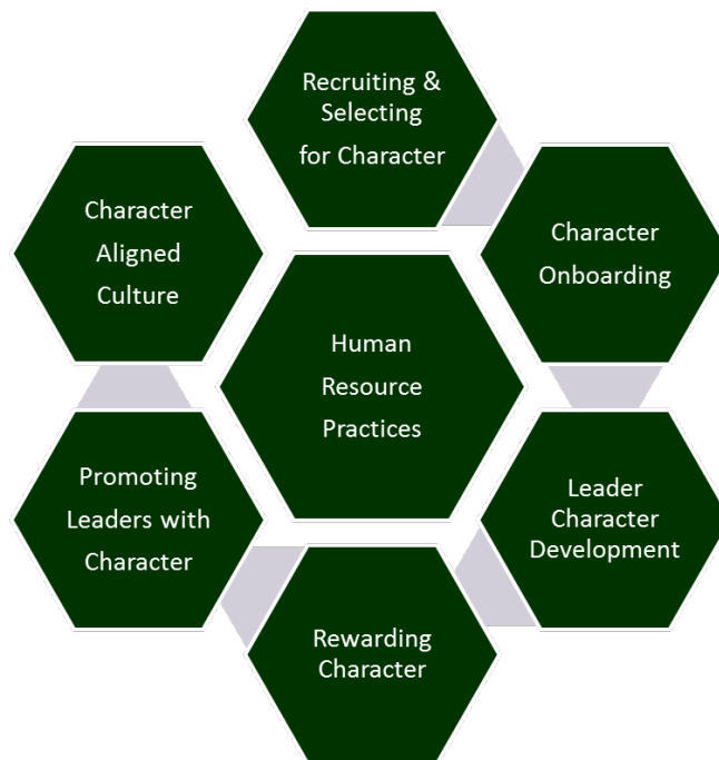
Figure 2: Leadership Character and Organizational Processes

Problematically, the process sometimes involves dealing with high producers who do not exemplify the character dimensions that are wanted. This has been abundantly clear in the terminations of senior executives for alleged sexual misconduct in the wake of the #MeToo movement. A culture of treating everyone with respect, providing opportunity for all to fulfill their potential, creating a safe and nurturing work environment, and striving for high-level performance will only be created when the people in charge have the right combination, reservoir, and balance of character dimensions.